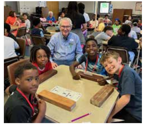
Volunteers from the Huntsville DBC with the students