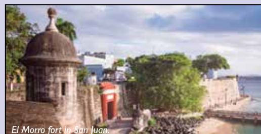
El Morro fort in San Juan.

Miami, Dominican Republic, San Juan, St. Barts, Dominica, Antigua, Tortola, Miami