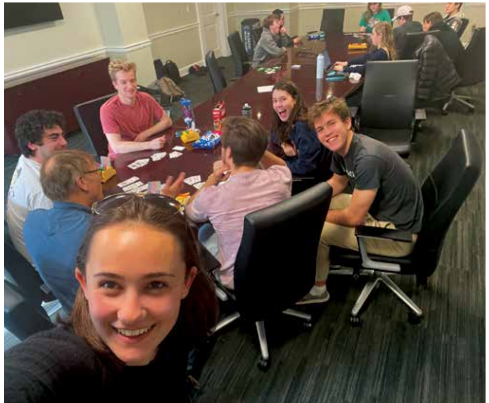
In its first year, the UVA club has 14 members regularly showing up for bridge lessons.