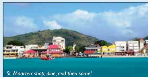
St. Maarten: shop, dine, and then some!

Miami; Philipsburg, St. Maarten; Charlotte Amalie, St. Thomas; CocoCay, Bahamas; Miami