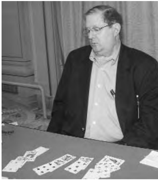
Paul Soloway during the 2003 World Championships in Monte Carlo, where his team won the Bermuda Bowl on the final deal of the match.