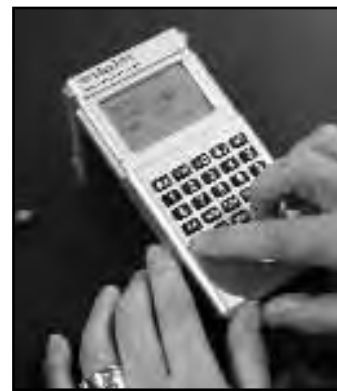
The BridgePad looks like a large calculator.